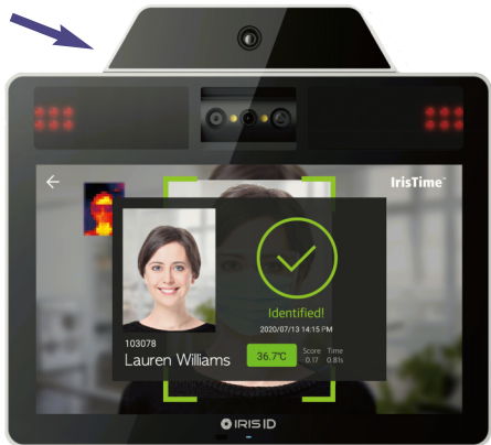
Image shows iT100 with optional Thermal sensor with accurate temperature detection